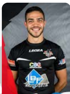
4. Roberto Speranza