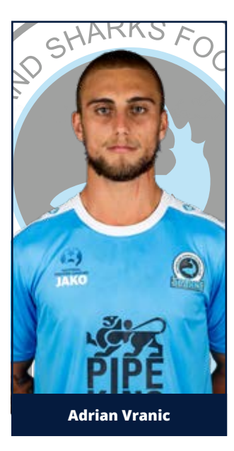
*Does not include FFA Cup goals