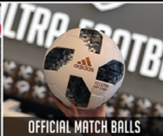
OFFICIAL MATCH BALLS