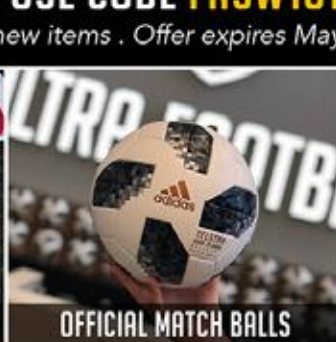
OFFICIAL MATCH BALLS