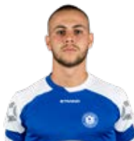
3. DE MARIGNY

AAA Tyre Factory Best brands. Best prices!