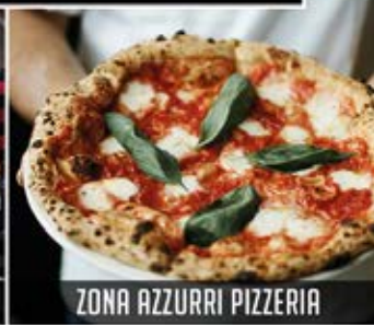
ZONA AZZURRI PIZZERIA

Term and Conditions: Offer expires July 31st 2018 . In store only . 1 voucher per customer . Voucher must be spent on the same day of redemption.