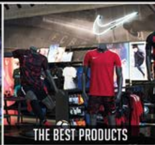
THE BEST PRODUCTS