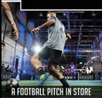
A FOOTBALL PITCH IN STORE

SIMPLY HEAD IN STORE WITH THIS FLYER TO REDEEM YOUR VOUCHER