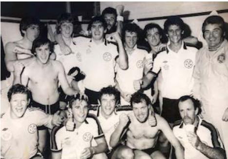
Winners are grinner's!!

3rd - The great bunch of lads I played with over the 7 seasons, it was an absolute honour to captain them, we weren't a very fashionable side but we left nothing in the changing rooms each game.