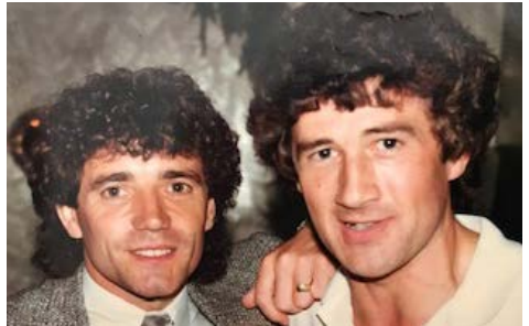
It's a good job he could play

We were all up in the box and shamed him into getting us a tip to back, he said Lounge Lizard was a good bet in the second last. We all put our money on it, it was first out of the gates and last by 20 meters at the finish!!